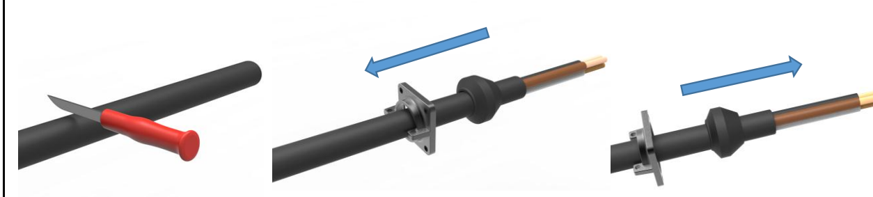
Strip the cable